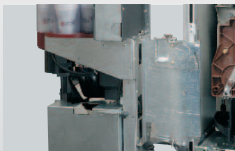
Cup dispenser with double hinge joint for complete articulation of the unit, facilitates access to the internal machine parts for all loading, maintenance and cleaning operations

The showing maximum capacity is purely indicative, weight can change depending on products.