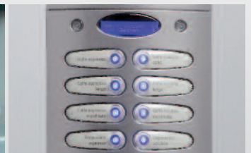
Electromechanical illuminated selection buttons