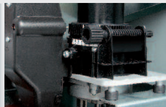
Flat blade professional grinder MF1