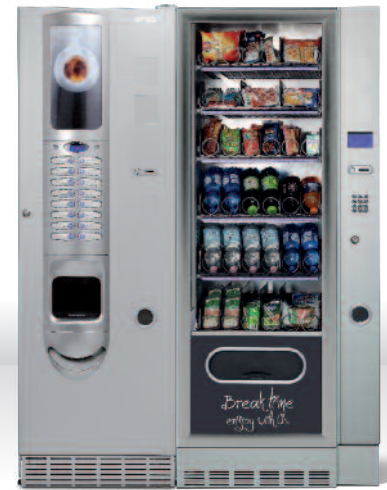
FAS 500 + Elettra